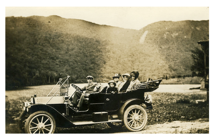
We'll see you at the Trout Club!

We make an effort to publicize each of our programs in the Stowe Reporter and the Transcript, so please mark your calendars and watch the papers! All are welcome.