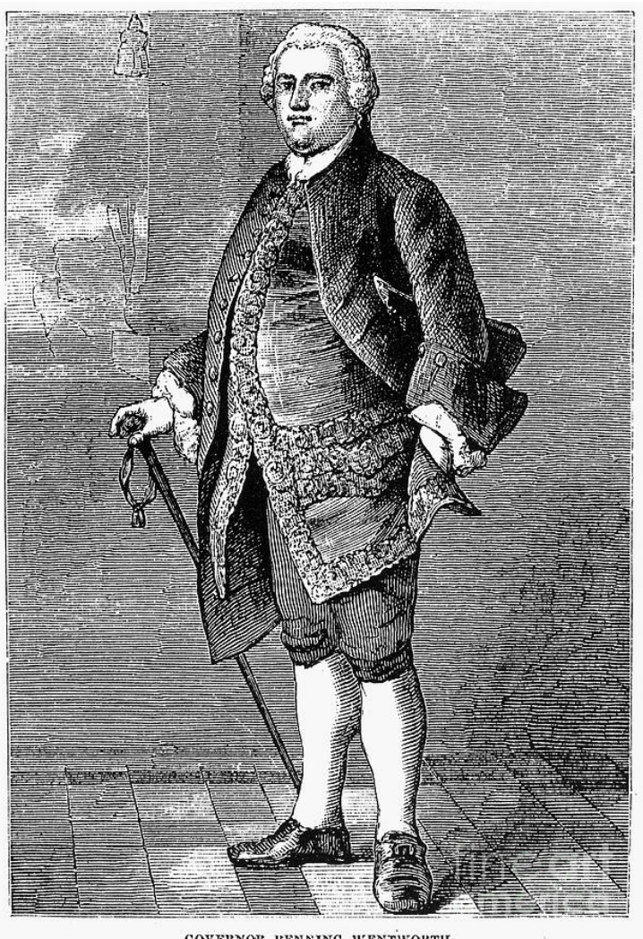
GOVERNOR BENNING WENTWORTH.

on 15 December beginning 15 December 1763